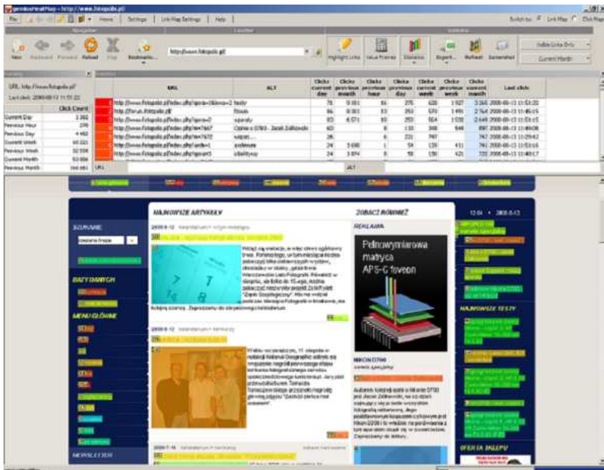
Interface view – LinkMap's module

gemiusHeatMap research contains two modules. The first one is LinkMap , which informs you about the clicks on the links and clickable elements (classic links and forms, javascript, ajax) available on your webpage. The results of the research are presented in a map of clicks seen directly on the web site. A devoted application enables you to view both the site and the graphical and numeral information about the clicks done. Thanks to LinkMap , information on Internet users' online behaviour is quickly available in a clear format.